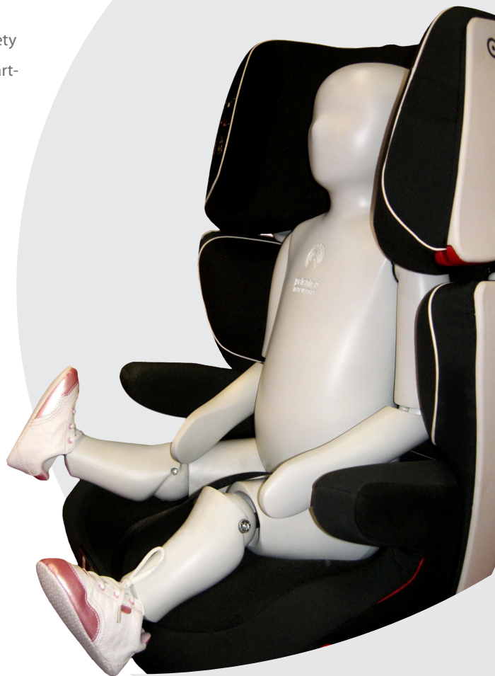
FORMAX ® baby active 76 cm