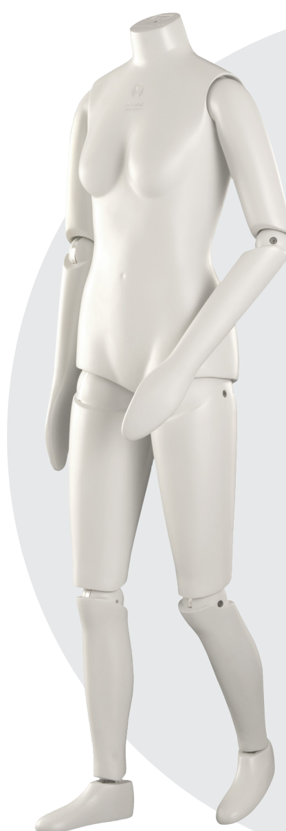
FORMAX ® woman body shape 9